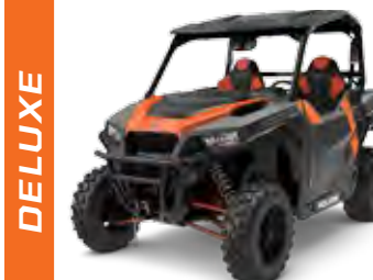
MODEL SHOWN: POLARIS GENERAL® 1000 EPS DELUXE