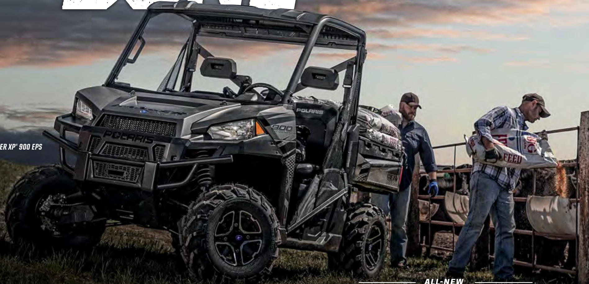
RANGER XP® 900 EPS

The benchmark by which all others are measured, Polaris® RANGER® is the number one selling utility vehicle in the industry –and nothing else even comes close. Delivering on our hardest working, smoothest riding promise, RANGER® offers the most powerful lineup, the best handling and the largest breadth of integrated accessories. You can do more, tow more, haul more and ride more.