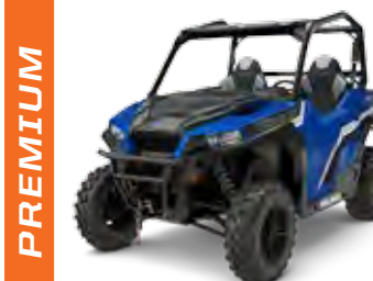
MODEL SHOWN: POLARIS GENERAL® 1000 EPS PREMIUM