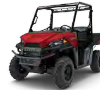
MODEL SHOWN: RANGER® 500