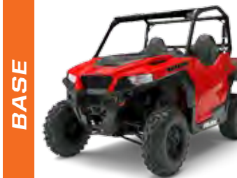
MODEL SHOWN: POLARIS GENERAL® 1000 EPS

CHOOSE YOUR POLARIS GENERAL® SEE FULL LINE-UP AT POLARIS.COM