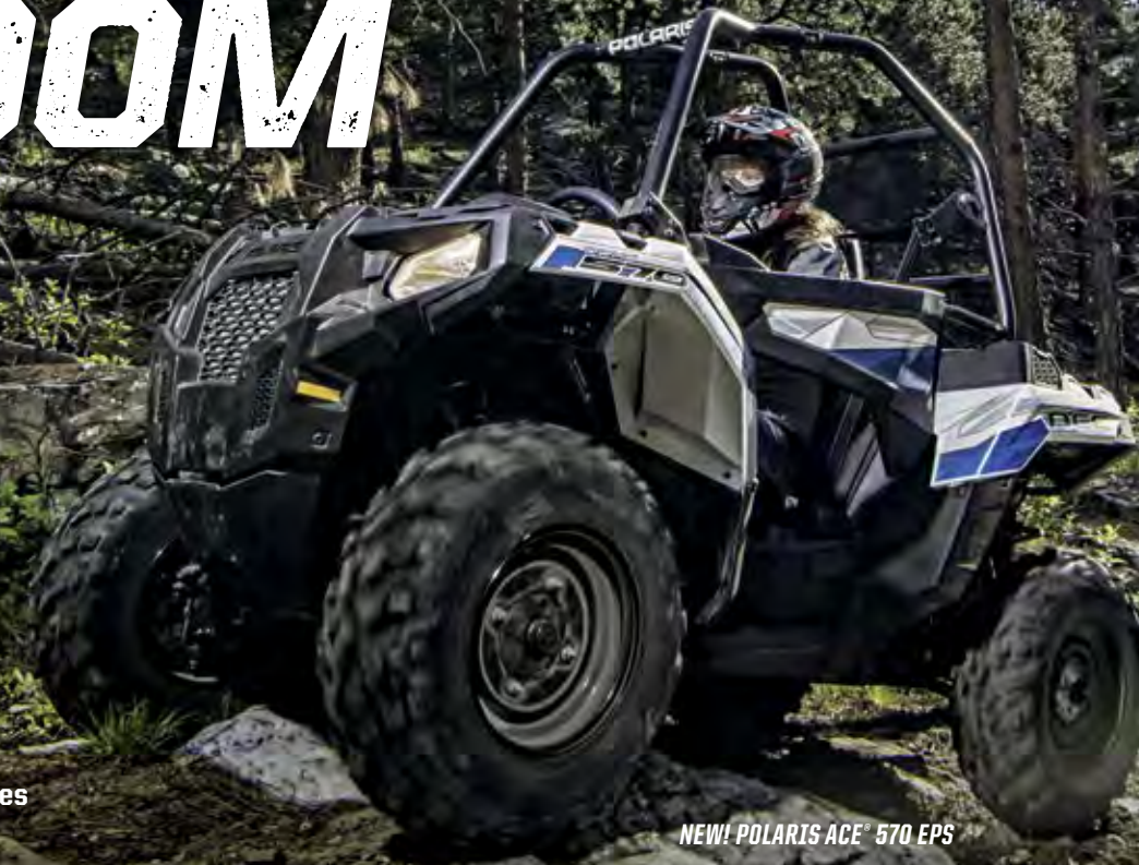
NEW! POLARIS ACE® 570 EPS

Chart your own path with the unparalleled Polaris ACE. Nimble, powerful and comfortable, the Polaris ACE delivers a unique center-seat singular experience with the go anywhere capabilities of an ATV combined with the familiar controls of a side-by-side.