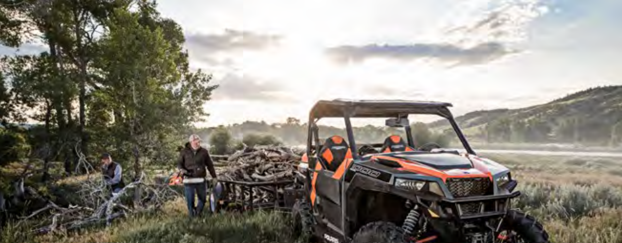
POLARIS GENERAL® 1000 EPS DELUXE

Polaris GENERAL® is the perfect combination of premium-performance and never quit work-ethic, melded into the perfect balance side-by-side that is ready for Any Task. Any Trail. Anytime. Where the high-performance soul of RZR® and the hard-working heart of RANGER® meet, you'll find the uncompromising Polaris GENERAL®.