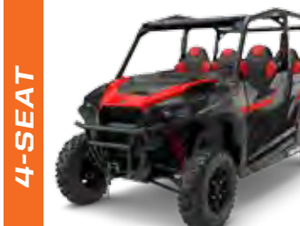
MODEL SHOWN: POLARIS GENERAL® 4 1000 EPS