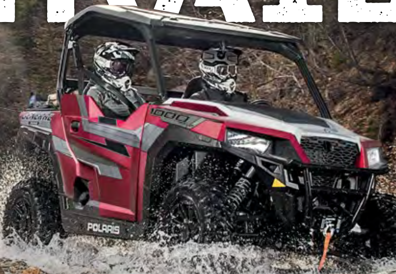
POLARIS GENERAL® 1000 EPS RIDE COMMAND® EDITION

Polaris GENERAL® is the perfect combination of premium-performance and never quit work-ethic, melded into the perfect balance side-by-side that is ready for Any Task. Any Trail. Anytime. Where the high-performance soul of RZR® and the hard-working heart of RANGER® meet, you'll find the uncompromising Polaris GENERAL®.