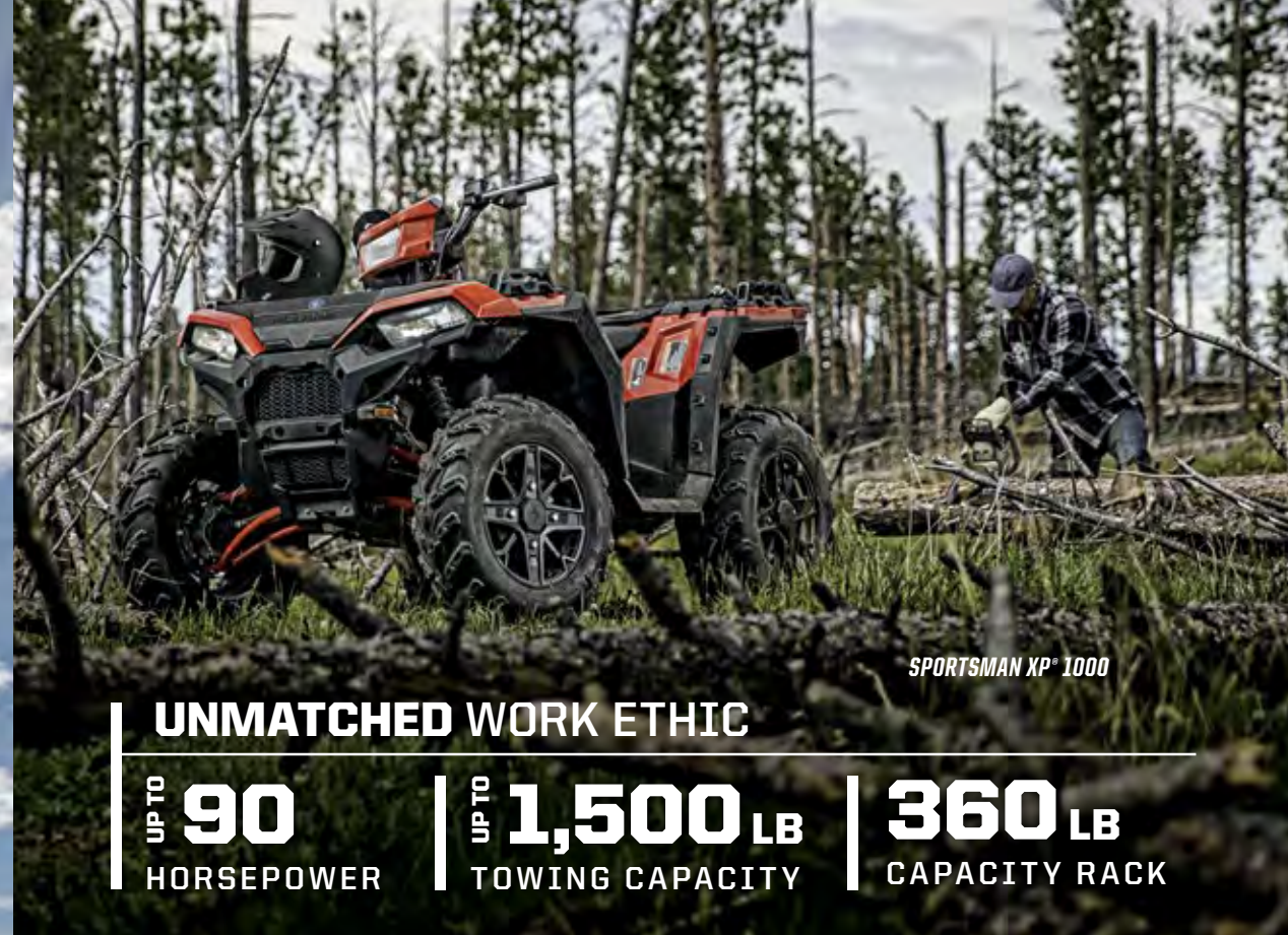
SPORTSMAN XP® 1000

SEE THE SPORTSMAN® IN ACTION AT POLARIS.COM