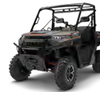
MODEL SHOWN: RANGER XP® 1000 EPS