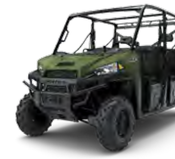
MODEL SHOWN: RANGER CREW® XP 1000