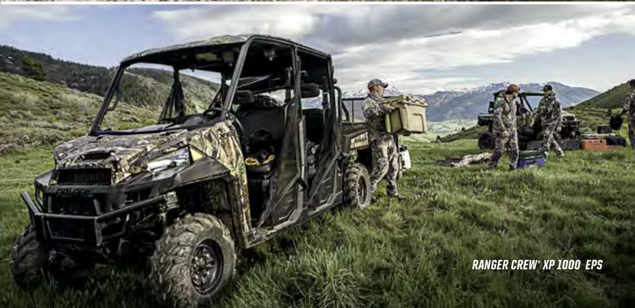
RANGER CREW® XP 1000 EPS