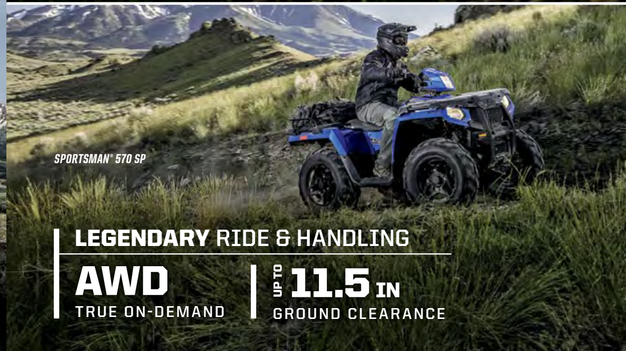
SPORTSMAN® 570 SP

UP TO 90 HORSEPOWER | UP TO 1,500 LB TOWING CAPACITY | 360 LB CAPACITY RACK