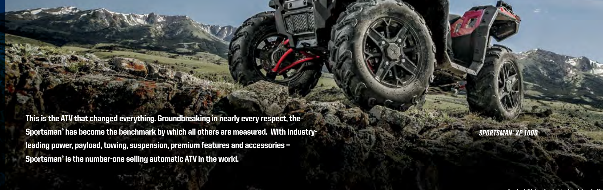
SPORTSMAN® XP 1000

This is the ATV that changed everything. Groundbreaking in nearly every respect, the Sportsman® has become the benchmark by which all others are measured. With industry-leading power, payload, towing, suspension, premium features and accessories – Sportsman® is the number-one selling automatic ATV in the world.