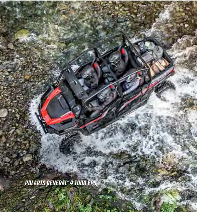
POLARIS GENERAL® 4 1000 EPS

1,500 LB TOWING CAPACITY | 600 LB DUMPING CARGO BOX | 100 HORSEPOWER