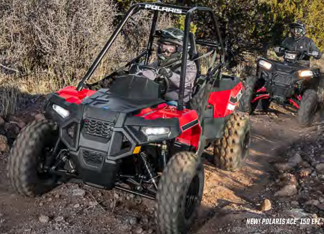
NEW! POLARIS ACE® 150 EFI

The industry's first single-seat youth model—the all-new Polaris Ace® 150 EFI is designed to give kids the joy of driving while providing safety features parents will love.